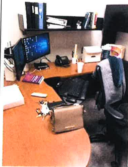
Shirlene Thatch Before