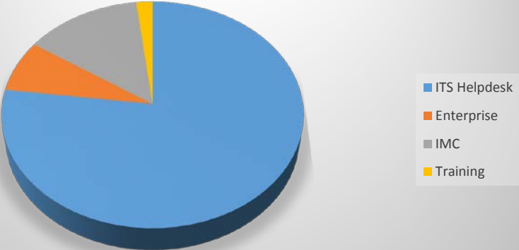
YTD Opened Tickets Distribution